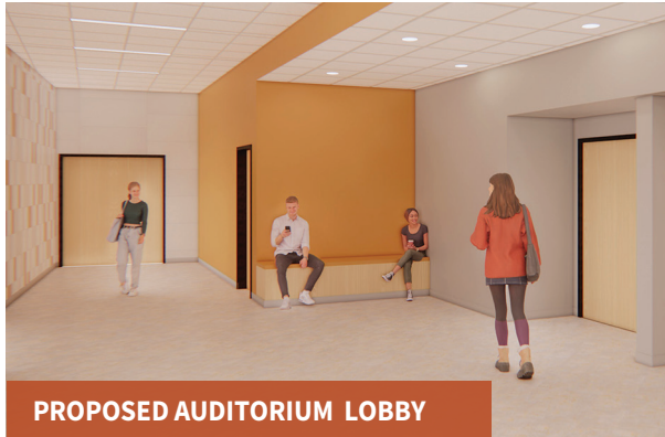
PROPOSED AUDITORIUM LOBBY

Enhancing the high school’s performing arts programming is a priority that