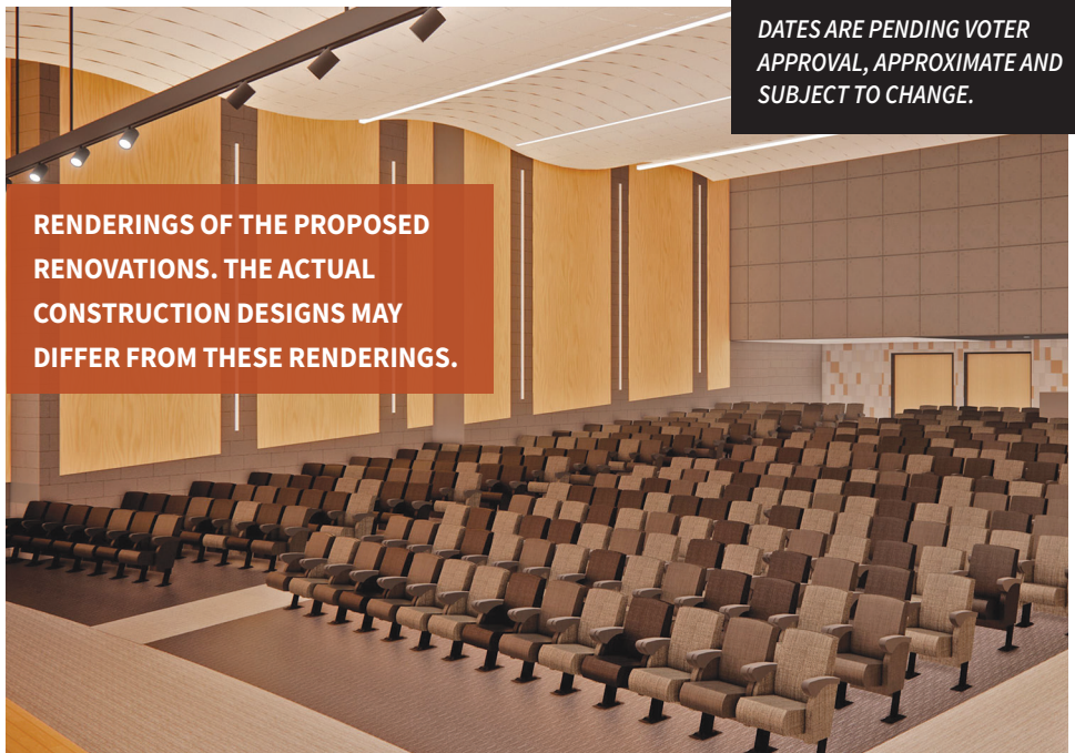
RENDERINGS OF THE PROPOSED RENOVATIONS. THE ACTUAL CONSTRUCTION DESIGNS MAY DIFFER FROM THESE RENDERINGS.

the district is currently undertaking. Participation in the arts has more than doubled since the beginning of the school year and our music teachers are working to ensure student schedules can be accommodated to receive more music opportunities. Additionally, with the district’s new Ag program, students in the FFA will have the opportunity to participate in public speaking competitions in the newly-renovated auditorium space.